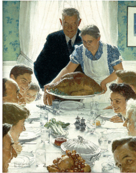
Freedom From Fear (Left) & Freedom From Want (Right), 1943, Norman Rockwell