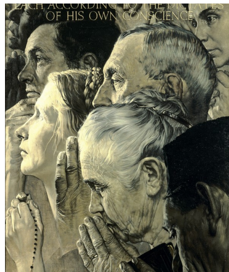
Freedom of Speech (Left) & Freedom of Worship (Right), 1943, Norman Rockwell